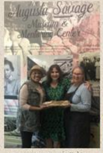
Augusta Savage Board who shared cookies with their students! (Above)