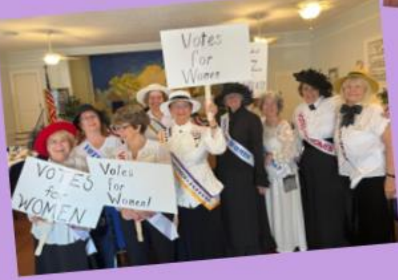
Purple is an official Suffragette color along with white, green and yellow!