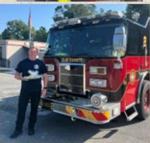
Thank you to our sponsor, Florida Blue!